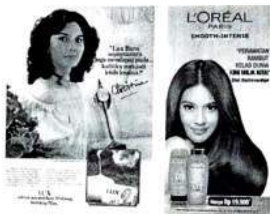
Figure 4. Some Multinational advertisements in local version

Because each community has its own unique culture, it is basically the world community is a multicultural society. People living and settled in a place that has a culture and its own characteristics which can be distinguished from one community to another. Each community produces each culture which would be typical for the community.