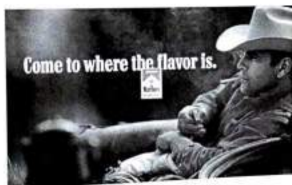
Figure 1: Some advertisements in international version

Speaking of international advertising, many people interpret that language in international advertising attached to the use of an international language, namely English. According to Stig Hjarvard (2014), English is the language most commonly used in nearly 60 countries and is the mother tongue sovereign third most widely spoken throughout the world, after Mandarin and Spanish. English is also used as a second language and the official language of the European Union, the Commonwealth, and the United Nations, as well as a variety of other organizations (Stig Hjarvard, 2004). This fact, English is considered as an international language that is used in the language of global advertising. Some examples of ads delivered in many countries with the same language, such as cigarette advertising Marlboro, Nike, BMW, Rodenstok glasses, and so on (figure 1).