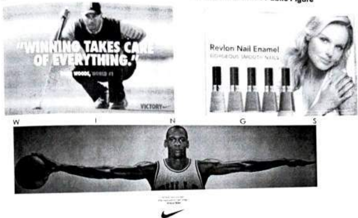
Figure 2: Celebrity Endorsement from International Artist / Actress / Public Figure

Advertising strategy that done by the multi-national Integration, as mentioned above contains weaknesses. Therefore, the targeted communities as a target audience by multi-national advertising messages have different cultures. Consideration of the relatively low cost and create a consistent image can't be accepted. Because the message is delivered from a different cultural perspective, the message is understood differently by the audience. The target audience can't feel comfortable with most or all of the messages in the global advertising. They will feel strange with messages and symbols used in the global advertising. The target audience feels that the advertising message is not intended for him. Further impact, the ad will not achieve the desired target as. Therefore, it is natural that the messages conveyed in advertisements conform to the national advertising is actually a form of communication between cultures, i.e. the message is delivered to audiences of different cultures.