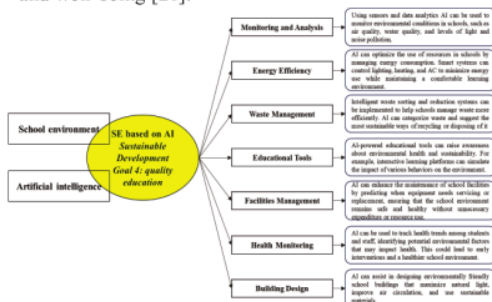
Fig. 3. AI-based school environment development framework for sustainable development goals.

In the realm of Monitoring and Analysis, the deployment of AI, with its sensors and data analytics, is transformative [20]. Schools can now continuously monitor crucial environmental parameters like air and water quality, and even ambient noise and lighting conditions, ensuring they meet health standards. Such vigilant oversight is paramount for preemptive action and maintaining an environment conducive to learning and well-being [21].