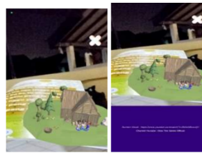
Figure 3. Animation improvements

it more interesting Interaction activities need to be added.