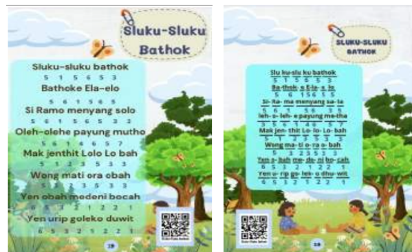
Figure 4 improvement with the addition of song beats