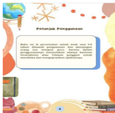
Figure 5. Addition of instructions for use

Figure 4 improvement with the addition of song beats