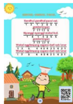
Picture. 2 Augmented Reality-based Toy Song encyclopaediaReality for Early Childhood

A needs assessment is an analysis conducted to identify differences between the actual situation and the situation expected by researchers. In Indonesia, students have song literacy scores that are far below the OECD average (OECD, 2018). Students have challenges in answering some basic knowledge. Other students also say that they are not interested in learning dolanan songs due to the lack of learning media that is interesting and appropriate for their age level. Based on observations and interviews with teachers, parents and children, there is still a lack of learning materials for children's songs based on AR technology. Meanwhile, AR makes learning more interesting and interactive, especially for children. Therefore, developing learning media that suits early childhood preferences is very important to help children improve their understanding of songs.