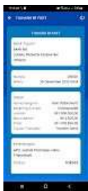
Bukti transfer-Trisnowati H.jpeg 84K