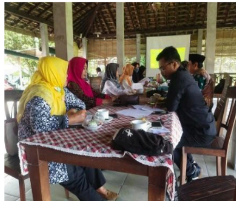
Fig. 2. Assistance Meeting

The Desa Bersinar program is carried out according to the event that has been determined by BNNK Bantul and Pendowoharjo Village. Activities that have been carried out include the Coordination Meeting of BNNK Bantul with the Pendowoharjo Village, the Assistance Meeting of BNNK Bantul with the Pendowoharjo Village, Technical Guidance and advocacy for 3 days BNNK Bantul with elements of the Pendowoharjo Village community, the Inauguration of the Desa Bersinar, Evaluation and Monitoring. In addition to conducting a coordination meeting with the village, the community counseling and prevention section of BNNK Bantul reviewed and conducted socialization in Pendowoharjo Village with the initial target of employees and visitors to Pendowoharjo Village with the aim of being the first step before the inauguration of Pendowoharjo Village as a Desa Bersinar. The coordination meeting aims to adjust the division of tasks of each employee in the relevant agencies, namely BNNK Bantul and Pendowoharjo Village. The coordination meeting was attended by BNNK Bantul staff and representatives of Pendowoharjo Village. This is also to minimize any miscommunication in carrying out tasks when it has been inaugurated as a Desa Bersinar.