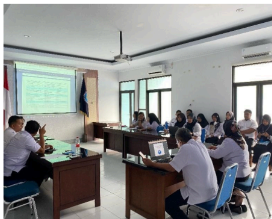
Fig. 5. Internal Meeting

continue to run with the existing cooperation or would be managed independently without coordination with BNNK Bantul.