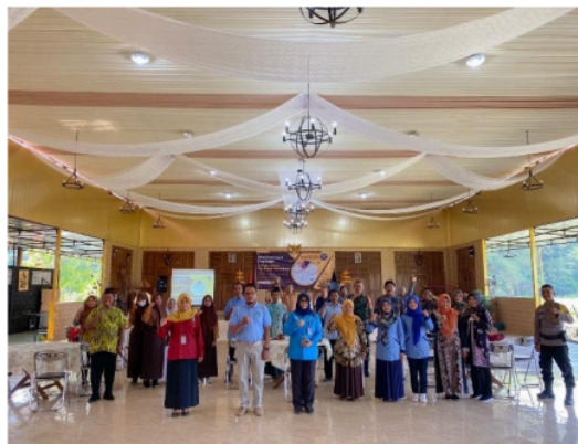
Fig. 4. Evaluation Meeting

The evaluation of the Desa Bersinar Program in Pendowoharjo Village is part of a series of activities of the Shining Village Program. In this evaluation, all representatives of the Pendowoharjo Village community were present, including from the Dukuh to the Village Head or Lurah , as well as the Regional Secretary (Sekda) of Bantul Regency and the Bersinar(Bersih Narkoba) Youth. The main focus of this evaluation was the performance and cooperation between the Bantul Regency National Narcotics Agency (BNNK) and Pendowoharjo Village, from coordination meetings to the implementation of the Desa Bersinar program activities. The performance that has been carried out during the one-year implementation of the Desa Bersinar program has been quite satisfactory. All working groups ( pokja ) have worked optimally even though there is still ineffective communication. Communication that is still not optimal is that there is still horizontal and vertical miss-communication. Miss communication with the village and BNNK as well as with the community.