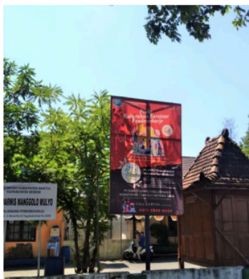
Fig. 3. Outdoor Media Source: Data from the field (2024)